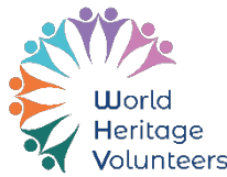
The World Heritage Volunteers Initiative logo

Please note that the organisations are NOT authorised to use the UNESCO logo and/or Better World logo in this context.